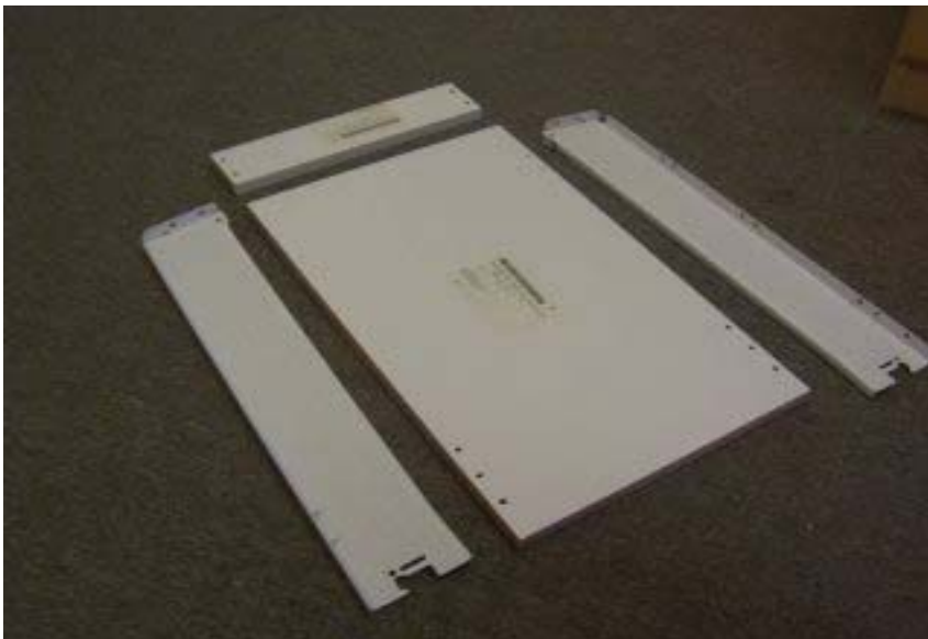
All unassembled parts for the complete drawer box assembly