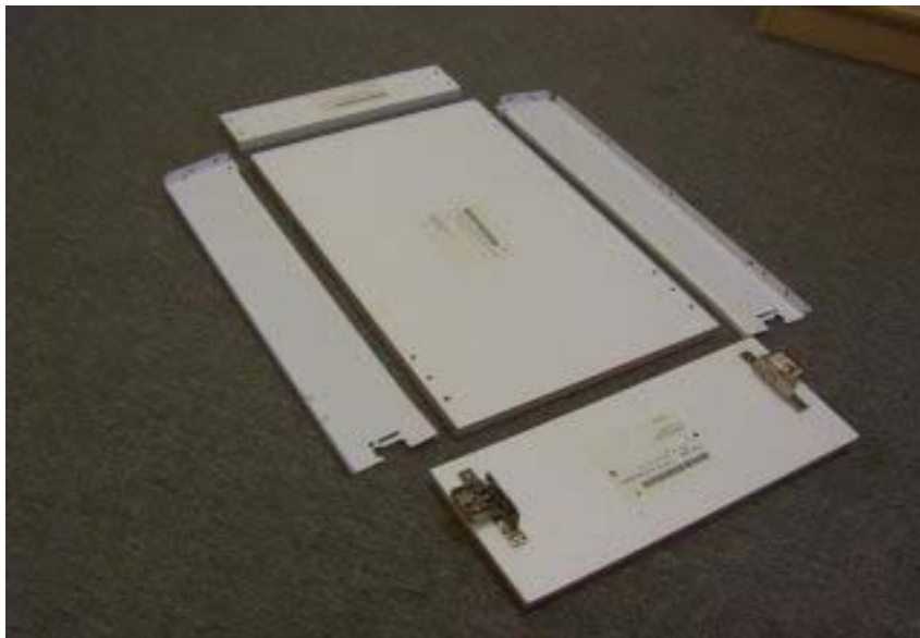
All unassembled parts including the drawer front